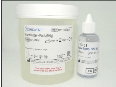
M511 SILICONE, 10:1