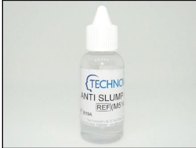
M514 ANTI-SLUMP AGENT