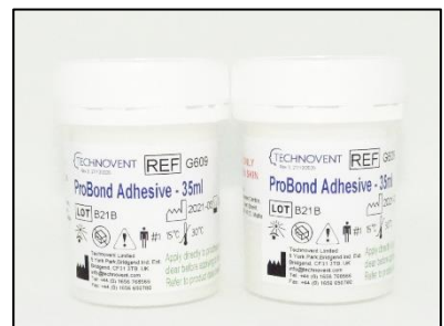
G609 PROBOND ADHESIVE