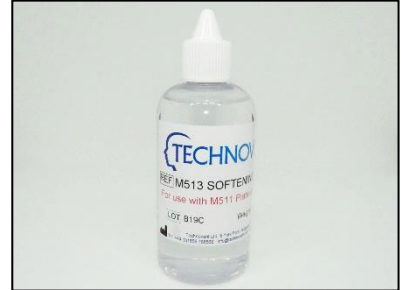
M513 SOFTENING AGENT