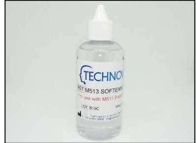
M513 SOFTENING AGENT