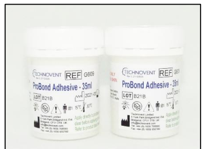
G609 PROBOND ADHESIVE